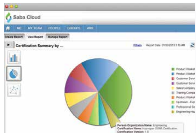
Reports and analytics