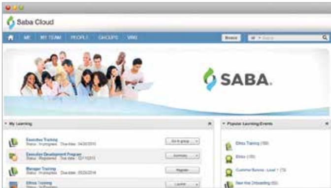
Learning@Work's personal home page can be configured to each learner's needs and preferences.