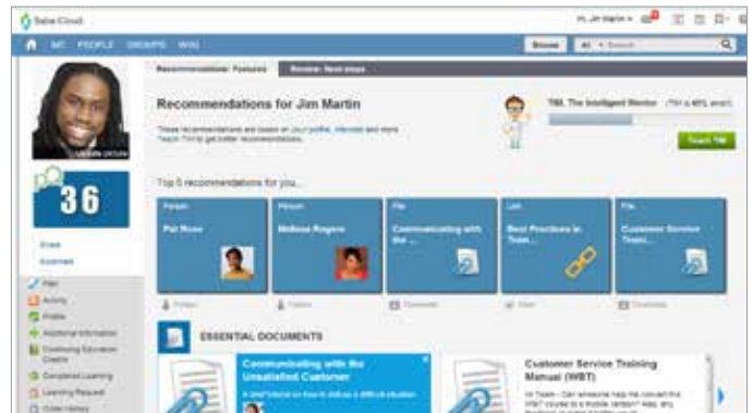
Personal recommendations of classes, content and experts

Learning@Work runs on Saba's certified secure, highly scalable, and highly available global cloud. Saba provides robust APIs and preconfigured connectors to integrate with other cloud and on premise platforms. With machine learning at its core, Intelligent Talent Management—powered by Saba Cloud—delivers proactive, personalized recommendations on classes, content, and experts to help unlock potential across the entire workforce.