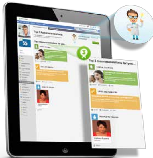
Personal and proactive learning

Saba clients enjoy a significant competitive advantage through superior regulatory compliance, training eCommerce, extended enterprise, leadership development, on-the-job training, and other learning activities. To make learning more personal, relevant, and engaging, Learning@Work incorporates numerous, patented innovations — gamification, social analytics, and machine learning to name a few. Help your people realize their potential with the industry's most advanced and accessible LMS.