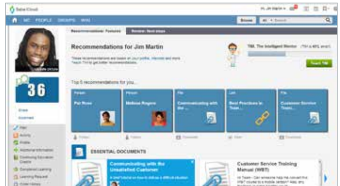
Personal recommendations of classes, content and experts

Learning@Work runs on Saba's certified secure, highly scalable, and highly available global cloud. Saba provides robust APIs and preconfigured connectors to integrate with other cloud and on premise platforms. With machine learning at its core, Intelligent Talent Management—powered by Saba Cloud—delivers proactive, personalized recommendations on classes, content, and experts to help unlock potential across the entire workforce.